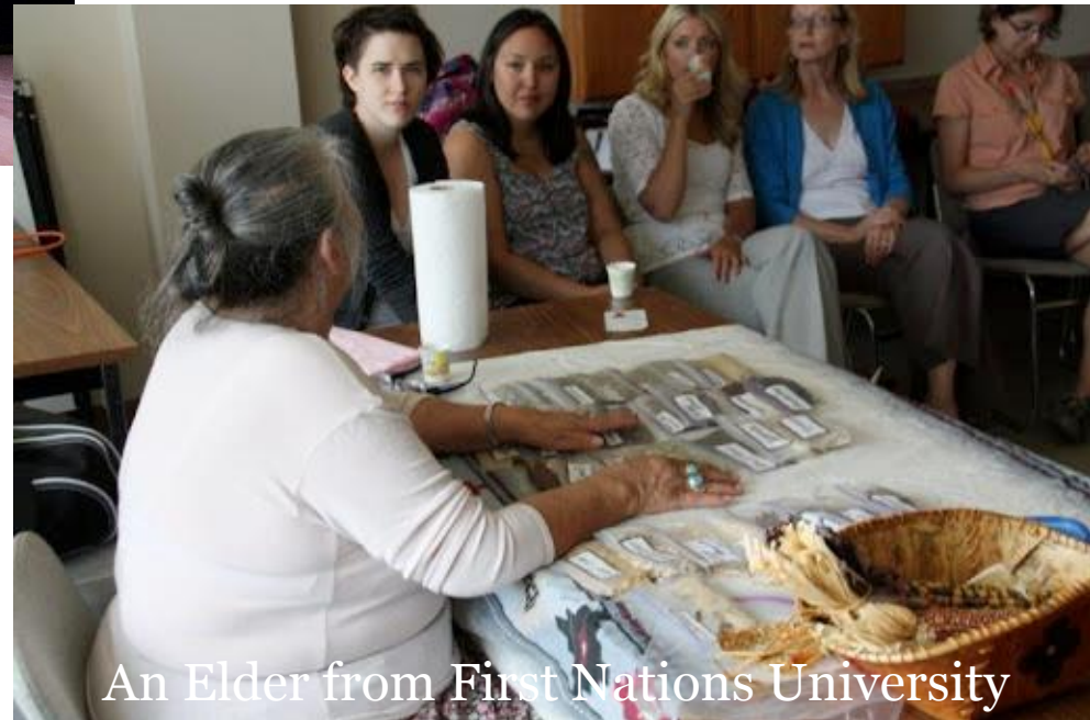
An Elder from First Nations University

https://www.flickr.com/photos/135136172@N05/37910084211